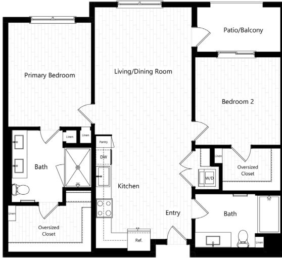
B1 - Base