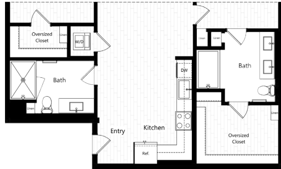
B1 - Alt Base 2